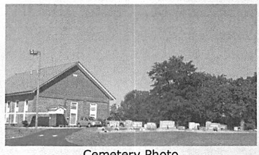
Cemetery