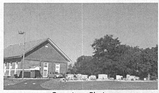
Cemetery